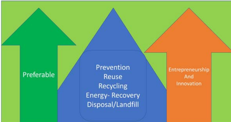
Figure 1 Entrepreneurship and innovation to move up in the recycling pyramid (see online version for colours)