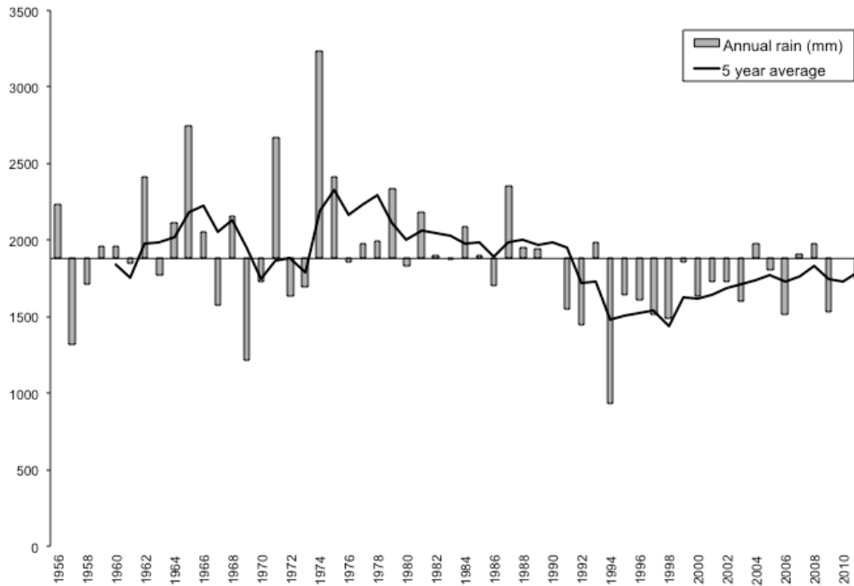
Figure 2 Annual rain, Udayapur district, Nepal (1956–2010)