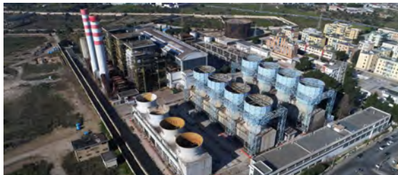
Figure 1 The ex-thermoelectric power plant of Bari (see online version for colours)

The thermoelectric power plant of Bari is characterised by a large size (around 60,000 sqm) and it is in a favourable position in terms of connections and accessibility being placed in an industrial neighbourhood near the city centre and not far from the seaside. Currently, the buildings on the area are in discrete conditions, except for the northern part belonging to the three tanks for fuel oil storage, which shows huge damages related to the fire occurred in 2013 as well as high levels of soil pollution caused by the fuel oils’ spill (Figure 1). Accordingly, the area presents uneven levels of pollution with the consequence that the types of reclamation interventions could be extremely varied.