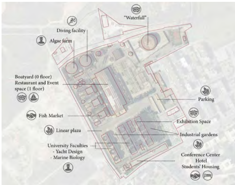
Figure 4 Design declination of alternative A_{12} (see online version for colours)

After having discussed the final ranking with the DM, he decided to investigate alternative A_{12} instead of alternative A_{16} . As often happens in decision-making processes of a territorial nature, the DM has opted for the alternative capable of producing greater profitability. This is in line with the objectives of MCDA procedures that aim to supply a recommendation based on elements of reasoning leaving the DM the ultimate responsibility for the definitive decision (see e.g., Roy, 1993). Moreover, observe in Table 9 that there was anyway a probability of 9.85% that alternative A_{12} could be preferred to alternative A_{16} , so we can conclude that the preferences represented by the