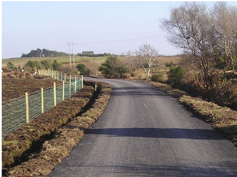
Figure 2 Great Western Greenway, County Mayo, Ireland (see online version for colours)